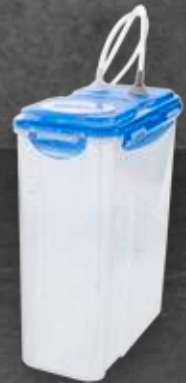
Included external water tank